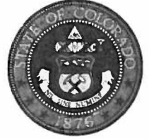
Bill Ritter, Jr. Governor

136 State Capitol Building Denver, Colorado 80203 (303) 866 - 2471 (303) 866 - 2003 fax