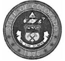
Bill Ritter, Jr. Governor

136 State Capitol Building Denver, Colorado 80203 (303) 866 - 2471 (303) 866 - 2003 fax