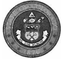
Bill Ritter, Jr. Governor

136 State Capitol Building Denver, Colorado 80203 (303) 866 - 2471 (303) 866 - 2003 fax