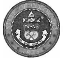
Bill Ritter, Jr. Governor

136 State Capitol Building Denver, Colorado 80203 (303) 866 - 2471 (303) 866 - 2003 fax