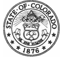
Bill Ritter, Jr. Governor

136 State Capitol Building Denver, Colorado 80203 (303) 866 - 2471 (303) 866 - 2003 fax