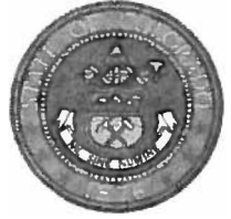
Bill Ritter, Jr. Governor

136 State Capitol Building Denver, Colorado 80203 (303) 866-2471 (303) 866-2003 fax