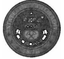
Bill Ritter, Jr. Governor

136 State Capitol Building Denver, Colorado 80203 (303) 866-2471 (303) 866-2003 fax