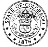
Bill Owens Governor

136 State Capitol Denver, Colorado 80203-1792 Phone (303) 866-2471