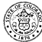
Roy Romer Governor