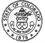
Richard D. Lamm, Governor

136 State Capitol Denver, Colorado 80203 Phone (303) 839-2471