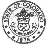
Richard D. Lamm, Governor

136 State Capitol Denver, Colorado 80203 Phone (303) 839-2471