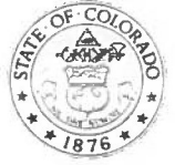
Richard D. Lamm, Governor

136 State Capitol Denver, Colorado 80203 Phone (303) 839-2471