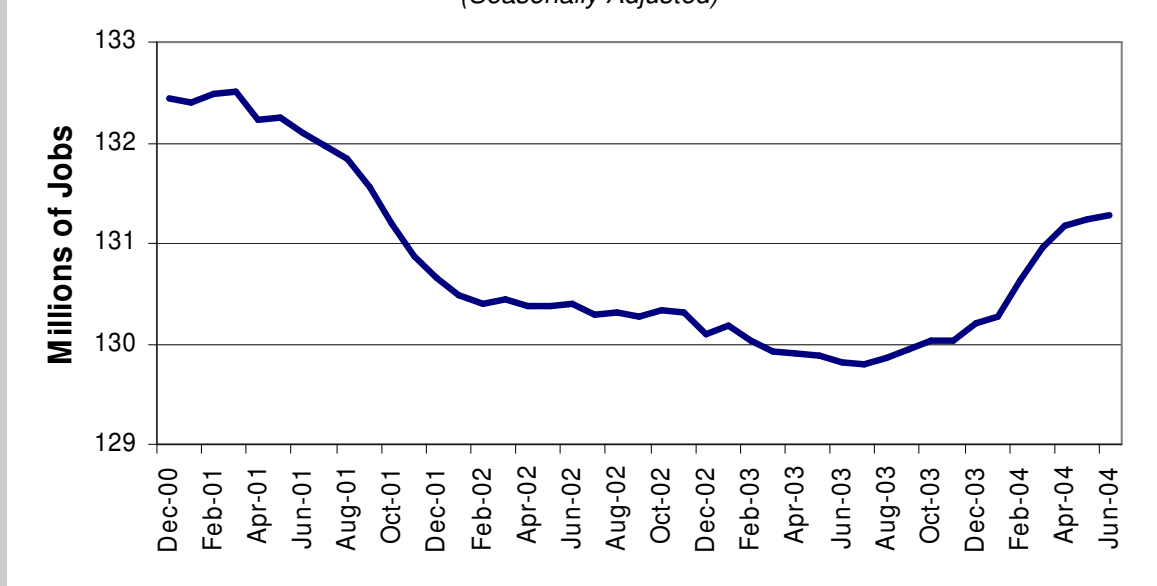
Figure 1 United States Employment (Seasonally Adjusted)

Legislative Council Staff • 029 State Capitol Building • Denver, Colorado 80203 • (303) 866-3521 lcs.economist@state.co.us • www.state.co.us/gov_dir