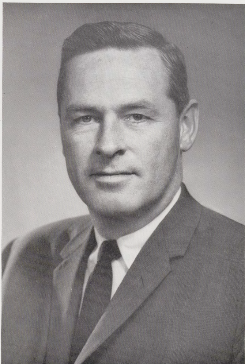
THE HONORABLE JOHN A. LOVE