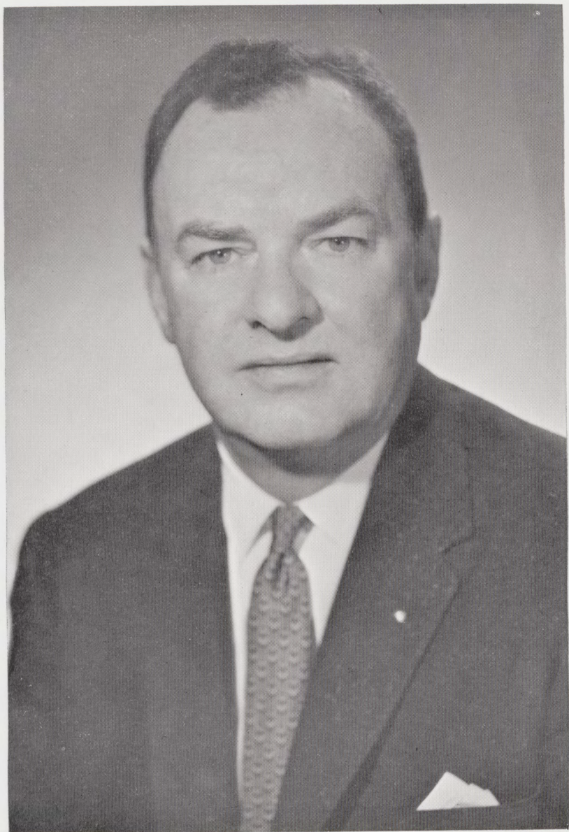
THE HONORABLE SAM N. BEERY Commissioner of Insurance