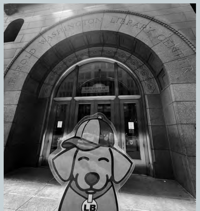
Image 2: Flat LB is wearing a baseball cap, standing in front of the Chicago Public Library. Fun Fact, this location houses the outreach and reader advisory portion of the Illinois Talking Book and Braille Service!