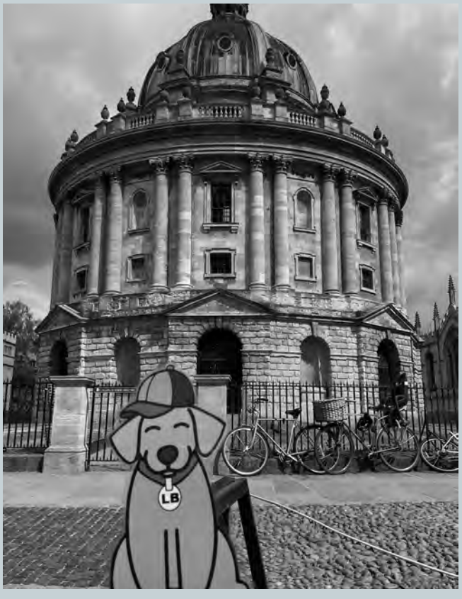
Image 4: Flat LB wearing a baseball cap, in front of the Radcliffe Camera, a building that is part of the Bodleian Library in Oxford, England.