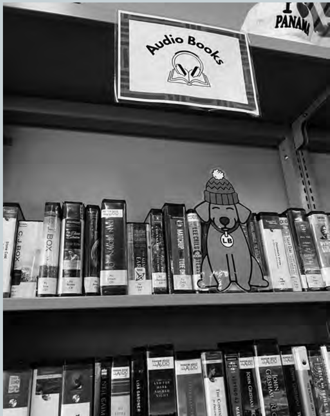
Image 3: Flat LB is wearing a winter hat, placed on the audiobook shelf at the Nederland Public Library.