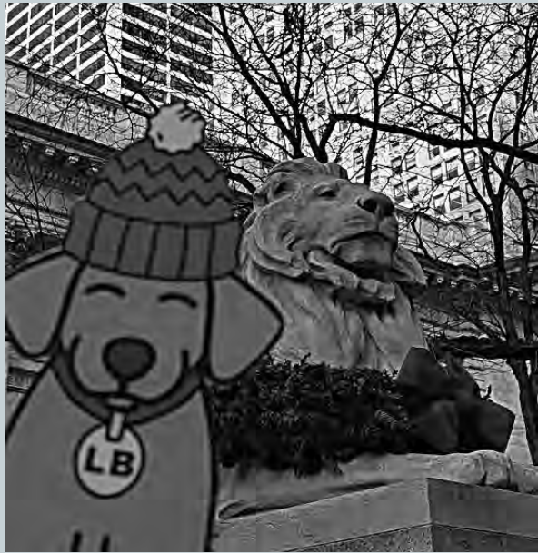
Image 5: Flat LB wearing a winter hat with the stone lion statue in front of the New York Public Library.