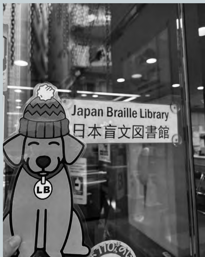
Image 1: Flat LB is wearing a winter hat and is in front of the Japan Braille Library.

Flat LB had quite an adventurous 2025, below are a few pictures from his travels to different libraries around the world! Please note, for picture descriptions when we say “Flat LB”, we are referring to a laminated paper print out of a cartoon golden retriever who is wearing a collar that says LB.