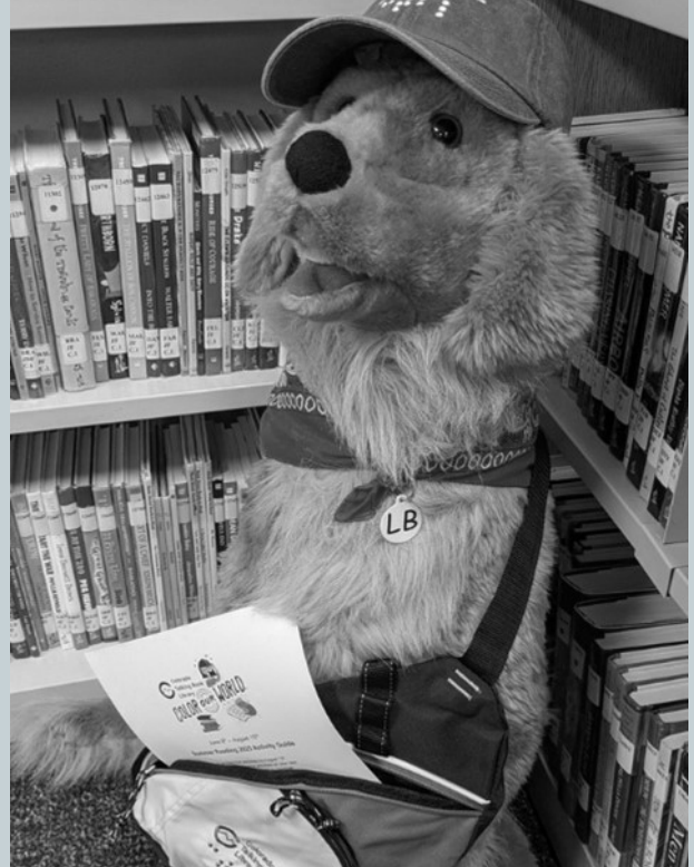
CTBL's mascot, LB, a stuffed animal dog, wearing the summer reading prizes, which are a hat and a sling bag.