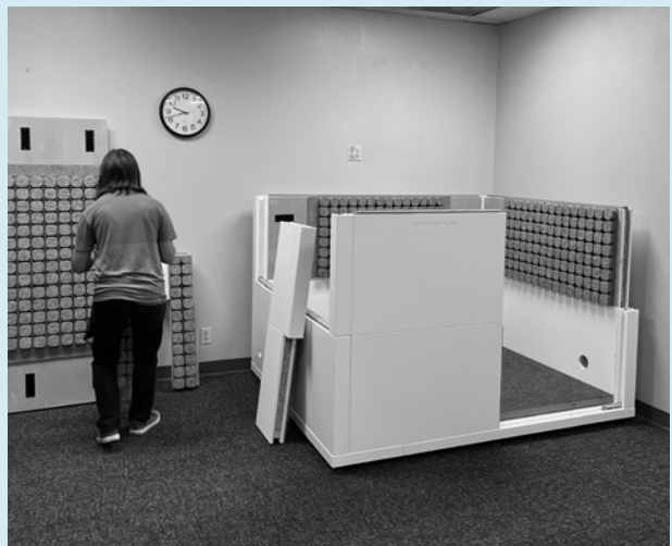
Volunteer assembles pieces of the recording booth.