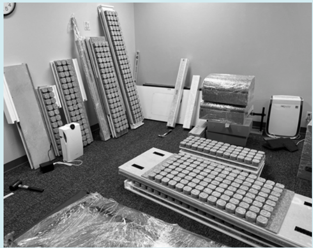
Unpacked components for the new recording booths are stacked against the wall and sorted into piles on the floor of the CTBL studio.

After a months-long manufacturing and shipping process, the new booths arrived in late spring, showing up on 6 large pallets weighing a combined 3900 lbs.!