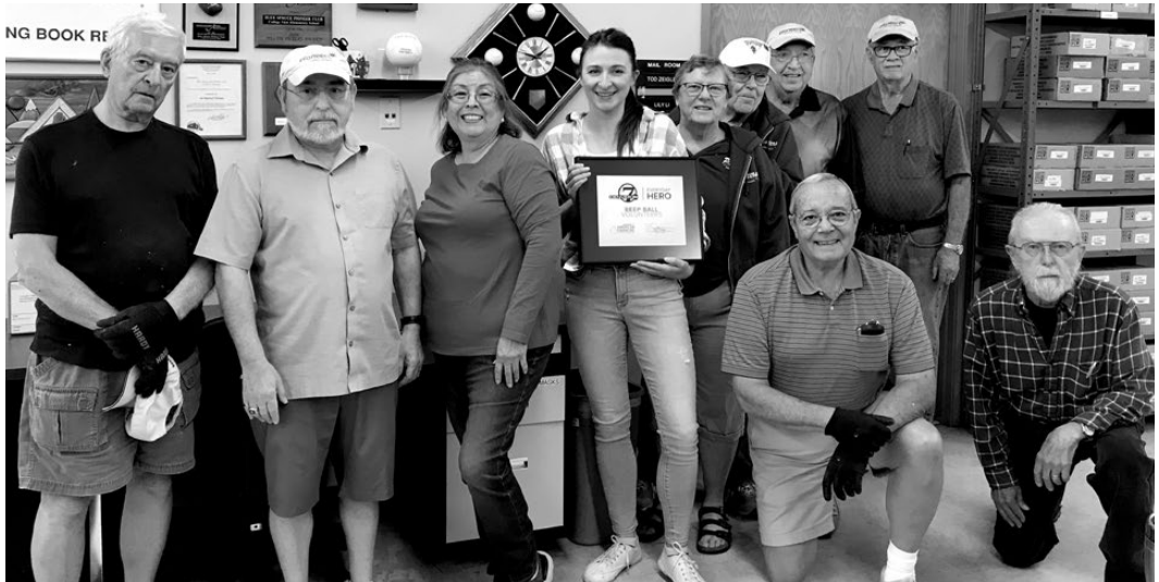
Beep Ball Volunteer Group holding their 7Everyday Hero certificate.

more about Beep Ball? Read on. The following article is courtesy of the Nevada Talking Book Services.