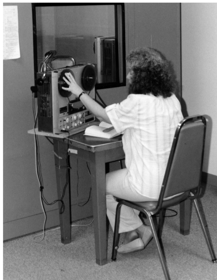
The recording studio, early 1990's