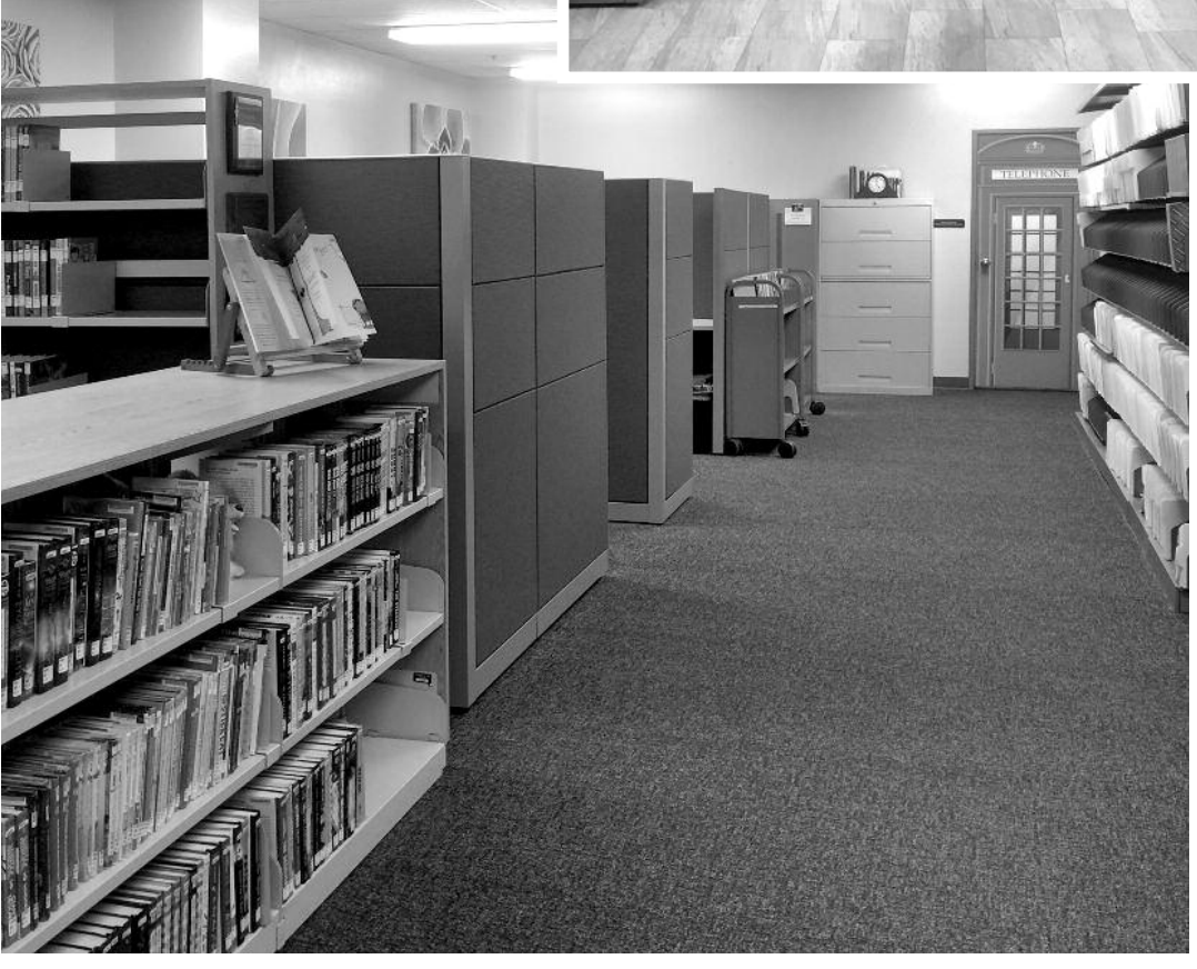
Technical Services area