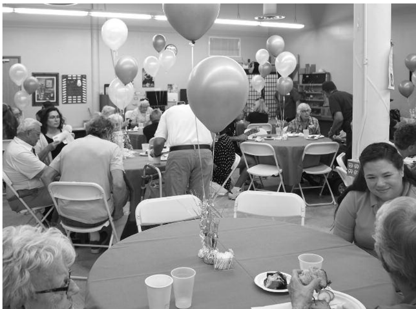
Mix and Mingle