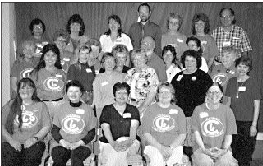
Pictured are all correctional library staff with CSL supervisor and regional consultants at the annual training institute, held last May.