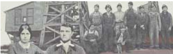
Mural on the Baseline Road façade of Lafayette Public Library

The study involved 182 adult fiction titles and 398 non-fiction titles of which the library owned two copies. All books involved in the study were at least one year old. For each title, one copy was displayed, while the other remained in the stacks. The library's standard checkout period is three weeks with a single renewal of an additional three weeks.