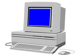
Internet Access at Public Libraries Metropolitan & Non-metropolitan Colorado & U.S., 1997

Nationwide, 34 percent of American adults use the Internet on at least a monthly basis, but 47 percent of Colorado adults do so. Similarly, the state's public libraries are 22 percent more likely than libraries nationwide to provide Internet access. Sixty percent of U.S. public libraries provide Internet access, compared with 73 percent in Colorado.