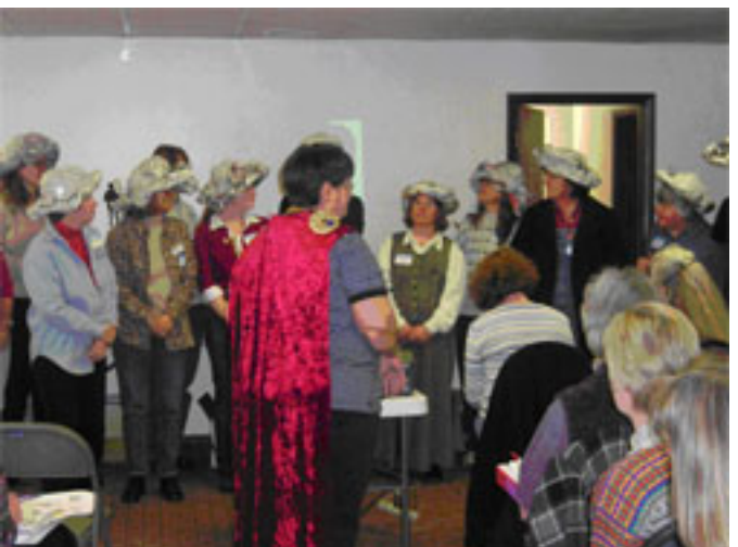
(Some of the participants at the workshop trainings practice their kidfriendly skills)

The Colorado State Library, with the essential support and hosting of Mesa County Public Library, presented workshops in early February on the Summer Reading Program, early literacy's Every Child Ready to Read @your library, along with a brainstorming session about reading programs for teens and adults. Response was enthusiastic and energetic. More than 60 people attended one or more of the sessions and made plans for their libraries' services. A new round of workshops statewide is planned for fall on similar topics.