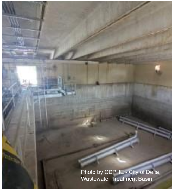
City of Delta, Wastewater Treatment Basin