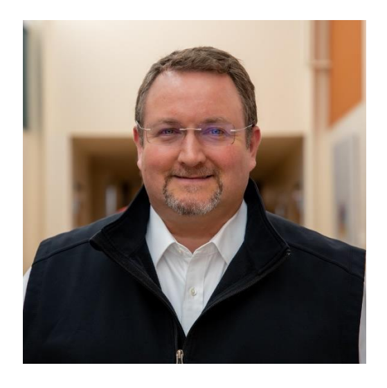
Welcome to Morgan Community College!

We consistently hear from our past students that MCC is a special place that made a difference in their lives. This is largely due to our faculty and staff who care about others like they are family. Your success is our top priority!