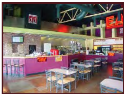
Double D's Sourdough Pizza

REAL. WHOLESOME. INDULGENT. Dine In, Delivery, Take Out, & Catering.