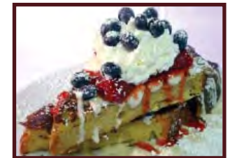
Berries and Cream French Toast Toast Fine Food & Coffee

Serving fine food and drink of the early West since 1963.