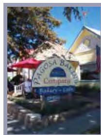
Pagosa Baking Company

All-you-can-eat crab legs for dinner, a grill station, carving station, made-to-order pasta and omelets, specialty salads, savory soups and special desserts featuring chocolate fountains.