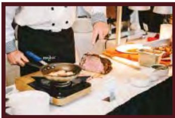
Brunch at The Inn at Palmer Divide

Upscale, fine dining with a Colorado casual atmosphere, featuring an award winning brunch, exceptional views and cuisine. An award winning wedding venue.