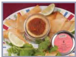
Decadence Gourmet Cheesecakes El Diablo 2

Made-to-order sandwiches, great pizzas, hamburgers, soups, salads, fresh baked cookies and more.