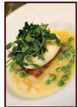
Pasta Carbonara Fruition Restaurant

We serve sophisticated comfort food that showcases the highest quality ingredients sourced through relationships.