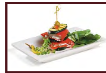
Verduas Tower TAPAteria