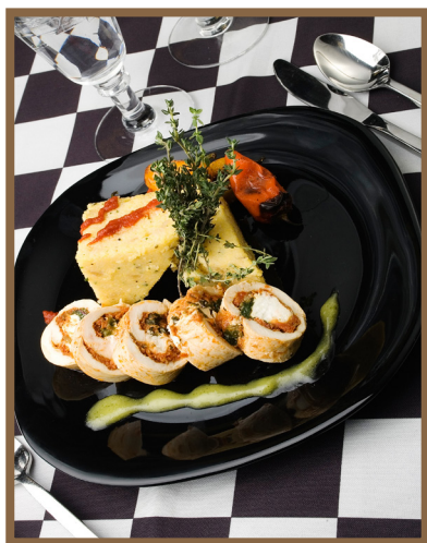
The Food Guy Catering

Colorado's freshly roasted artisan coffee, handcrafted sandwiches and salads, healthy smoothies, and free wi-fi in a café atmosphere. Nine locations to serve you.