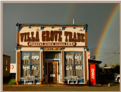
Villa Grove Trade

When you're thirsty for fun and hungry for some seriously good Mexican food right in the heart of downtown, there's only one place in Steamboat that will serve you right, whether it's for après ski, after hiking, or just because. Food, fun and margaritas at The Steamboat Rio, with downtown's only rooftop patio and great views of both Mount Werner and Howelsen Hill to refresh your spirit.