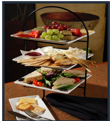
Tea Tray at Wystone's World Teas

Finest in Colorado Contemporary cuisine with an award-winning wine list, two chef tasting menus, and impeccable service.