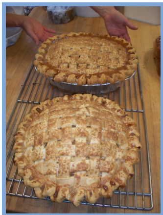
Pagosa Baking Company Apple Pies

A farm market and cafe proudly serving delicious food made from local ingredients.