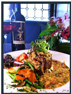
Craftwood Inn's Rattlesnake Stuffed Buffalo Tenderloin

Upscale, fine dining with a Colorado casual atmosphere, featuring an award-winning brunch, exceptional views and cuisine.