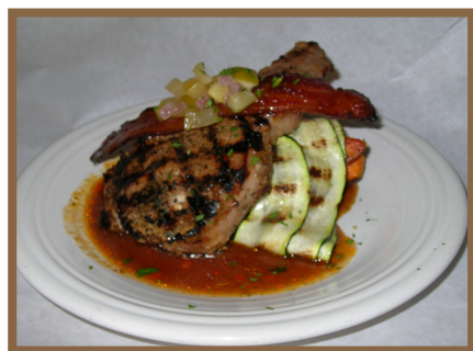
Honey Grilled Pork Chop with Lacquered Bacon and Apple-Jalapeno Jam Laughing Ladies Restaurant

Casual, quick serve venue with a vast variety of menu items. Our burger menu offers unique and tasty creations and are one of the best served in Black Hawk. Enjoy!