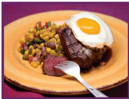
Incorrect Steak, The Fort

In a pot, heat up chicken stock to a simmer. Meanwhile, heat oil in a large sauté pan. When oil is quite hot but not smoking yet, add garlic and whisk quickly into oil. Immediately add flour and whisk until smooth. Add Dixon and whisk until no lumps remain. Reduce heat to medium and cook roux, whisking constantly, until it become light and fluffy. Do not brown the roux. Add roux to stock slowly while whisking stock constantly. Bring sauce back to a simmer and add salt, pepper and oregano. Simmer for 10 minutes.