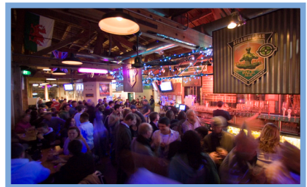
Steamworks Brewing Company

Casual Italian, family friendly, Colorado theme with gourmet pizzas, salads, pastas, paninis and calzones.