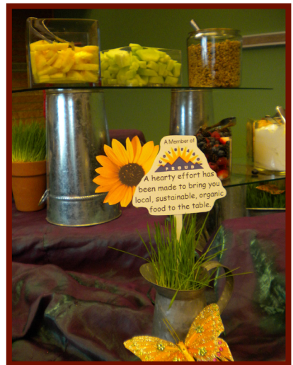
Taste of the Wild Catering

Local, natural and organic food prepared eclectically for your event.