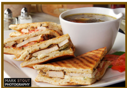
Enjoy tea infused specialties at Wystone's World Teas

Chimney Park Restaurant & Bar has a warm and inviting atmosphere combined with a straightforward approach to cuisine. Our menu reflects seasonality and features items produced within the local region. Exceptional service and an award-winning wine program will assure you an outstanding dining experience.