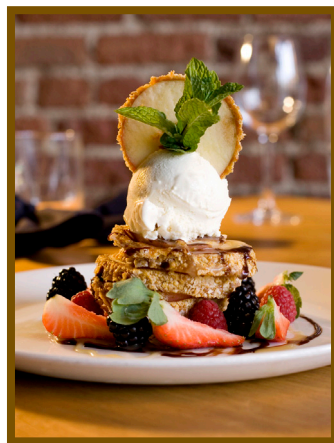
Vesta Dipping Grill's Wacky Apple

Fast and casual in a relaxed atmosphere with wi-fi. Catering also available.