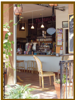
The Stone Cup Cafe & Gallery

Handmade ice cream and gelato, smoothies, shakes, sundaes and fine handmade chocolate truffles.