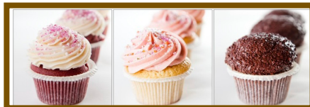
Cupcakes from Lovely Confections Bakery

Olivéa offers inspired Mediterranean cuisine made using Colorado produce.