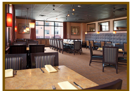
The Golden Hotel

Great homemade Mexican food and large margaritas with a view of the Continental Divide.