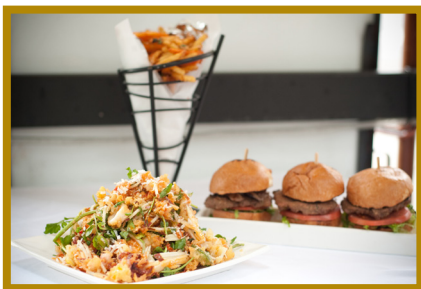
Dinner at Parallel Seventeen

Authentic New Mexican fare by the Martinez Family since 1965. Fun atmosphere and fabulous margaritas.