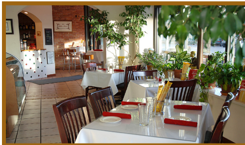
Il Bistro Italiano

Located east of historic downtown. Featuring traditional Italian cuisine. A popular destination for locals and tourists for over 13 years.