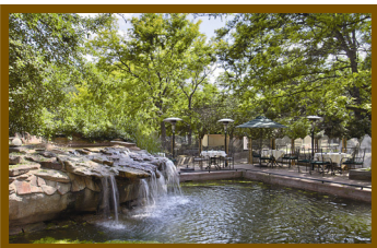
Thyme on the Creek Restaurant Patio