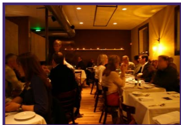
Aix Restaurant & Wine Bar, Denver

Family restaurant featuring a very relaxed atmosphere.