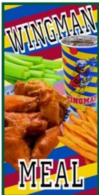
Wingman, Five Denver metro locations

For over 10 years we have delivered sandwiches, salads and breakfast for business meetings and private functions. All served on artisan breads from Udi's Bakery and always delivered on time.