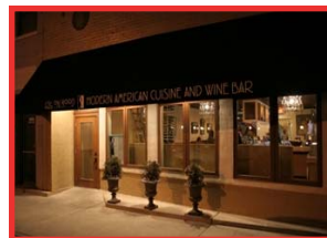
626 on Rood, Grand Junction