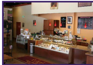
Belvedere Belgian Chocolate Shop, Boulder

A charming family-run cafe and gallery offering organic coffees, homemade pastries, smoothies, sandwiches and more.