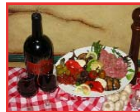
Garlic Mike's Italian Cuisine, Gunnison & Montrose

Casual dining in a pleasant and comfortable western brewery. Offering a full bar and extensive wine selection.