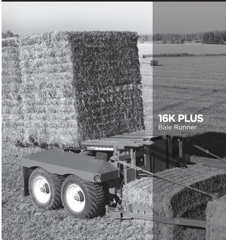
16K PLUS Bale Runner