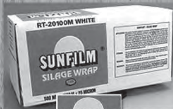
SUNFILM SILAGE WRAP