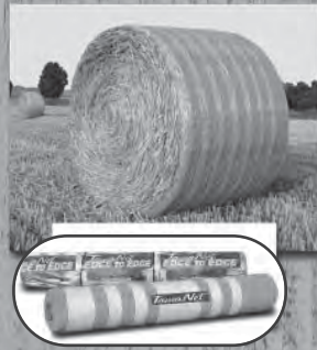
Net Wrap for Round Bales TamaNet Edge to Edge™