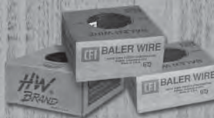
CF&I and HW Brand Baler Wire