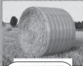
Net Wrap for Round Bales TamaNet Edge to Edge™