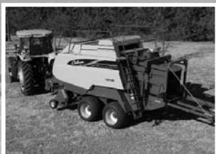
Rugged Challenger ® Hay Balers and Windrowers

Branches in Colorado, New Mexico and West Texas