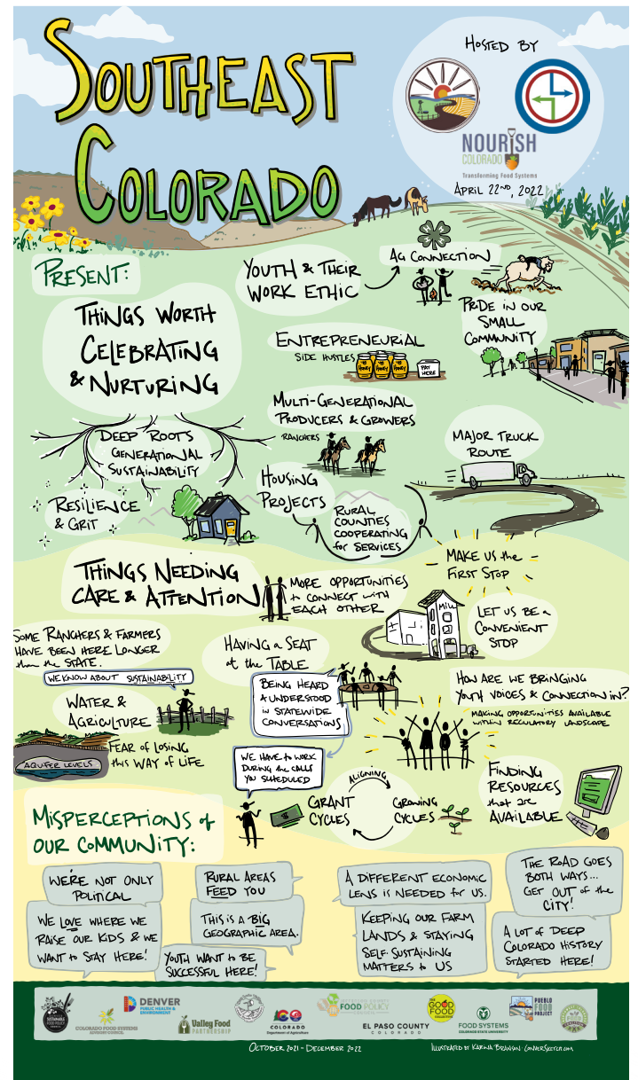
Figure 2: Visual representation of the Lamar convening

Through the summit, relationships formed between COFSAC leadership and staff from regional food policy councils (who collectively formed the organizing committee), establishing a strong foundation for future communication and collaboration.