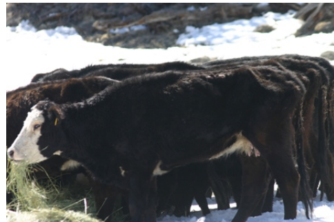
Park County provided hay