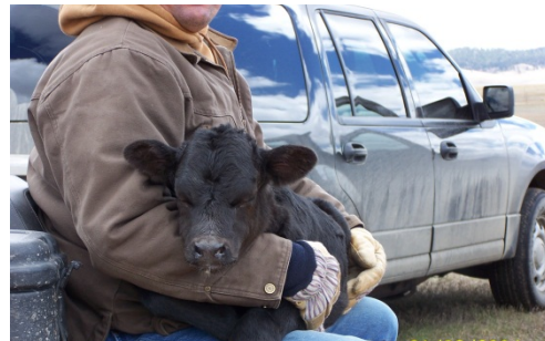
Weak calf transported for treatment